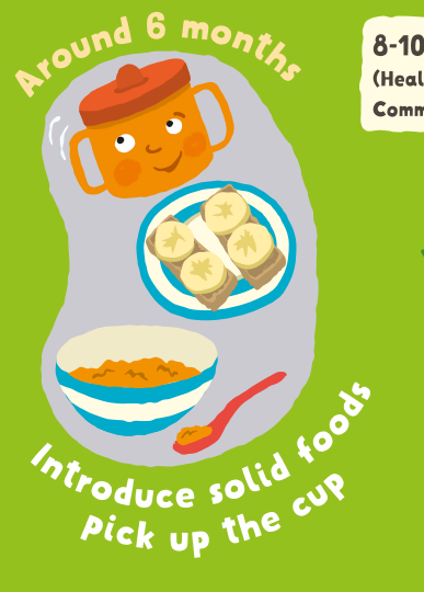
8-10 month review (Health Visitor/ Community Nursery Nurse)