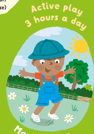
oving more and sitting less